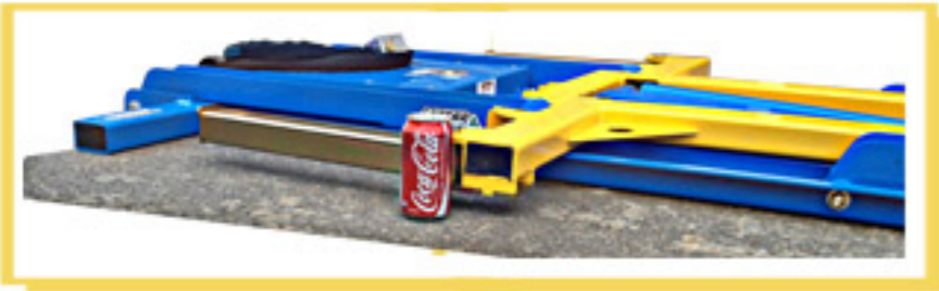
"Coke Cola NOT supplied"