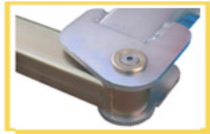
Swing Arm Lock